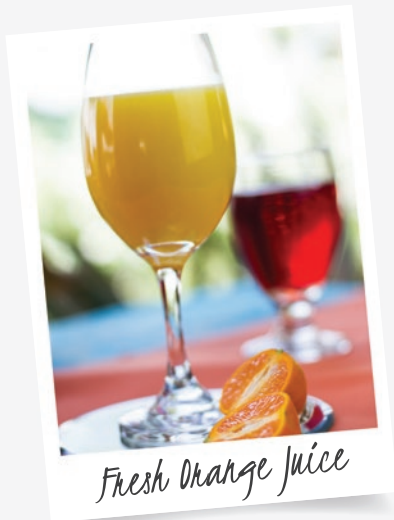
Fresh Orange Juice